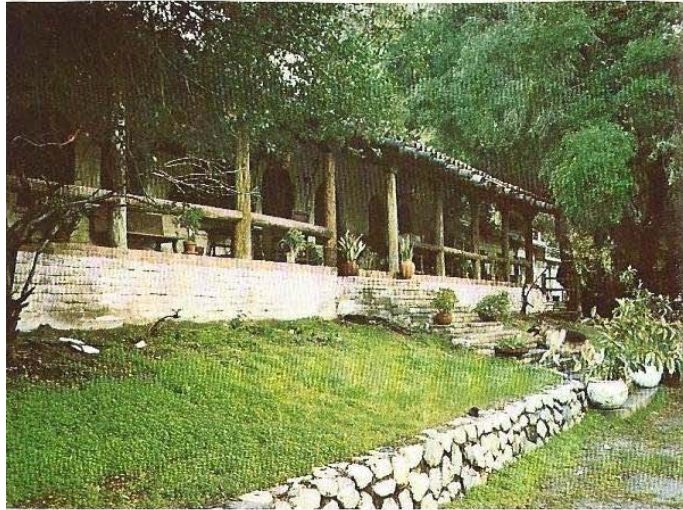
Spanish Hacienda at SABLE RANCH

For Further Information and Reservations and for Appointment Contact: FRANK'S CAMERA 5715 N. Figueroa St., L.A., CA. 90042