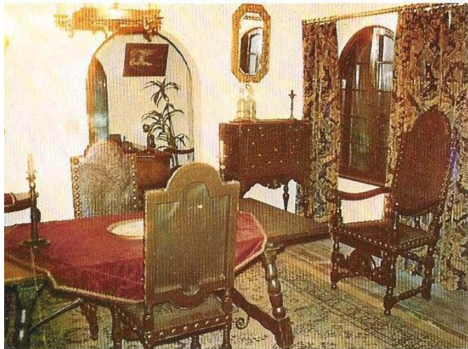
Interior of Hacienda