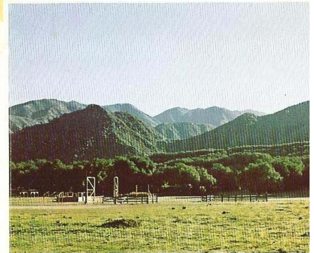
Meadow and Landing Strip at SABLE RANCH